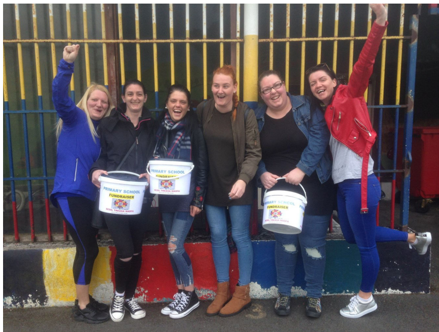
Pictured: Some of our fantastic parent and student volunteers