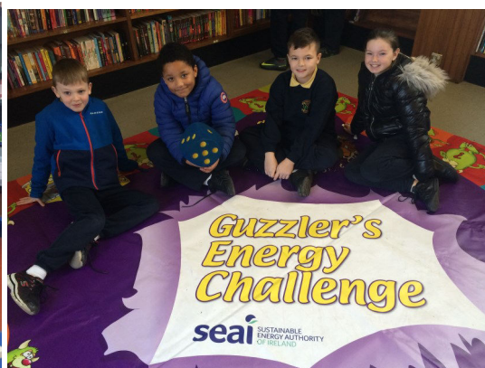
Pictures above: Our dedicated Green School Committee who have done the school so proud this year.