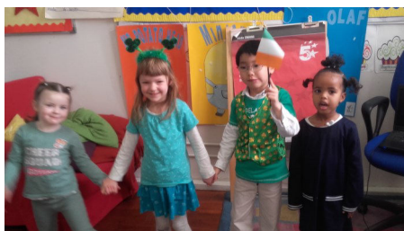
1st Class A + B

Junior Infants have been really busy, working very hard for our student teacher who was here on teaching practice. She played loads of cool new games with us! Right now, we are working as vets as part of our Aistear programme and we are taking great care of our stick animals. You know who to call if your pet is sick! Have a great Easter. Don't eat too many Easter eggs!