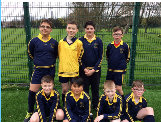
Pictured above and below: Boys and Girls Football Teams who performed at recent blitz events.