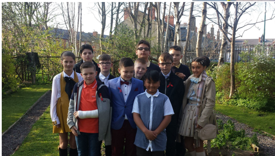
Most of the 6th class children who recently made their confirmation